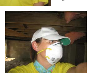
"Whether urban myth or veritas, the story of the library card found in a flood ravaged home will become a permanent part of library lore."