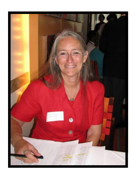
DCLA Annual Banquet May 7 2008