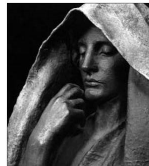
Marian Hooper Adams Memorial in Rock Creek Cemetery

Angels Projects are pro-bono work days for which Washington Conservation Guild members volunteer their conservation expertise at a particular historic site. They are generally conducted all in one day, although the preparation and follow-up require additional time. Angels Projects pair conservators with collections that need care. A group of conservators typically preservation. The Foundation for the American Institute for Conservation granted nearly $1,000 for supplies for proper storage of the HSW textile collection. The history of Angels Projects dates back to the late 1980s when members of WCG's parent group, the American Institute for Conservation, began incorporating Angels Projects at sites near their annual meetings. During the following years, Angels have rehoused collections for storage upgrades, preserved daguerreotypes